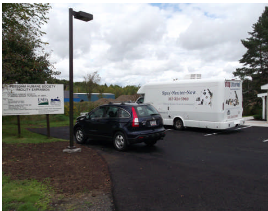
Potsdam Humane Society hosted a SNN Clinic at their new facility in fall 2011.

The need for organizations to coordinate and cooperate together cannot be stressed enough. In 2011, SNN worked together with other animal organizations in the region including the St. Lawrence Valley SPCA, Potsdam Humane Society, Massena Humane Society, Jefferson County SPCA, Friends 4 Pound Paws and the Lewis County Humane Society.